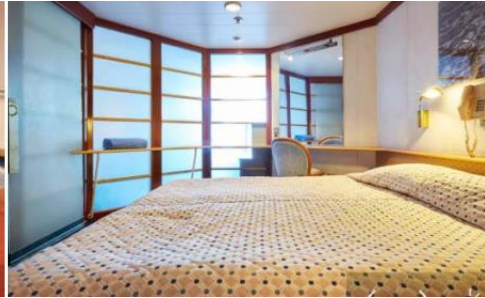
Suite with balcony SB private room