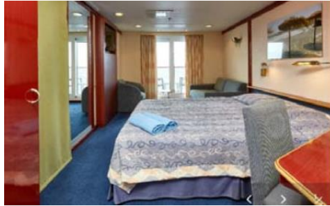
Junior Suite with balcony SBJ